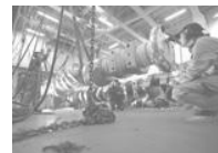
PrimeServ After Sales Service